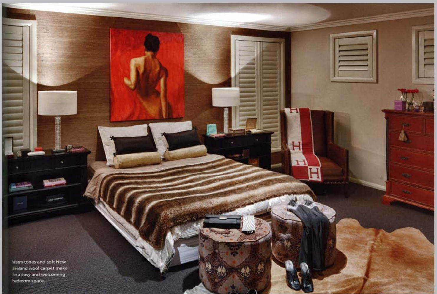
Warm tones and soft New Zealand wool carpet make for a cosy and welcoming bedroom space.

BLUES, REDS, CHOCOLATE BROWNS AND ROYAL PURPLES — AMGAD HAS USED THEM ALL. EACH DESIGN AESTHETIC SEEMS TO MESH PERFECTLY WITH THE OTHER, DESPITE THE USE OF COMPLETELY DIFFERENT MATERIALS.